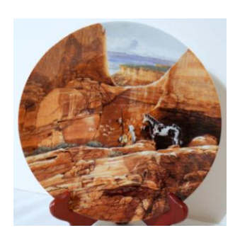
Plate Four, "Wolf Pack of the Ancients"; Plate Six "Wintering With the Wopiti"; Plate Seven "Within Sunrise"; And Plate Eight, "Wambli Okiye"

FOR SALE: Four collectible plates. The "Faces of Nature Collection" by Julie Kraemer Cole is available. There were eight in the entire set. We have four available. Pictures below. These are amazing collector's plate celebrating the natural and spiritual beauty of the American West. The pictures feature magnificent native American vistas, each with nature's faces hidden within the landscape. The technique of partially concealing images within a scene.