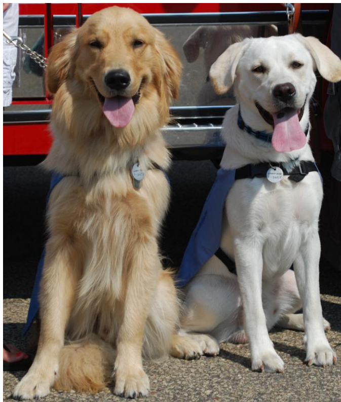
"Luke" ( left )