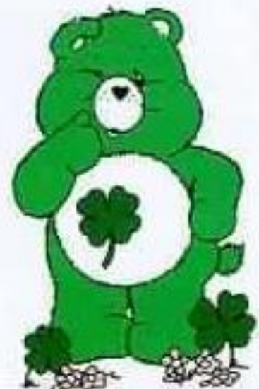
GOOD LUCK BEAR® #X-1030