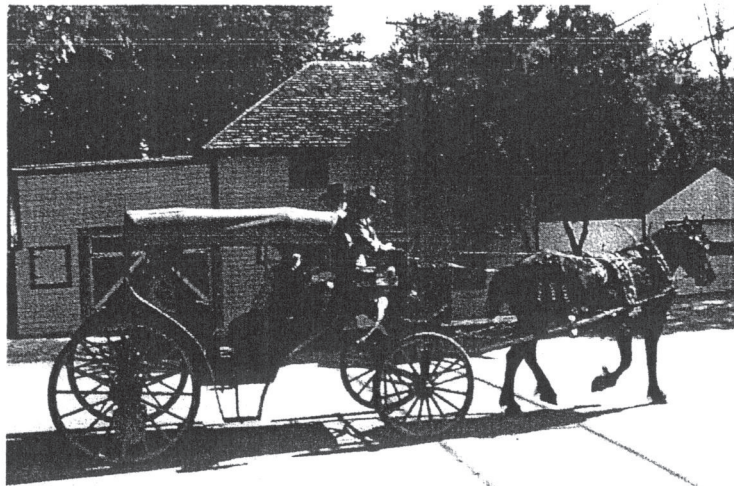
Carriage ride / tour during SteamBoat Days - 2008