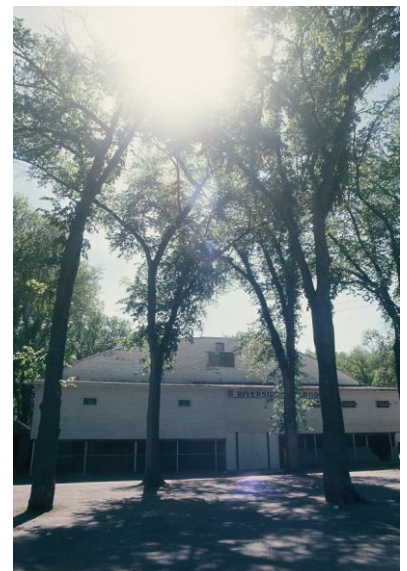
Riverside Ballroom ( 1930 – 1985 ) on Riverside Park

The Ballroom was destroyed on December 13 th , 1985 by fire. Many suspected arson, it was never proven. The long nostalgic era of the Carver tradition came to an end in Riverside Park on the Minnesota River that early morning Friday morning. Not only did the ballroom era end with all its visitors attracted but also the end of several other businesses in Carver. One included the Riverside Café on Broadway at Main Street. The occasional floods of the Minnesota River never washed away the traditions of the Riverside Pavilion nor the Riverside Ballroom, but instead they were ended by a tornado and a fire.”