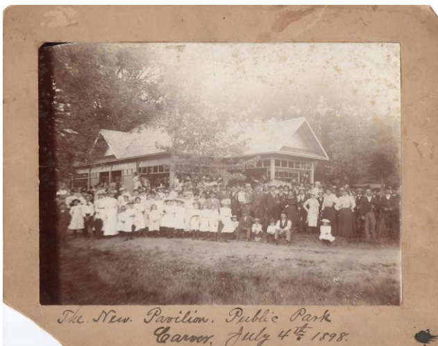
The New Pavilion. Public Park Carver. July 4 th 1898.

The possible uses for the recreated structure could be inclusive of SteamBoat Days venue, Soggy Bottom Open Gold Clubhouse, RiverSide Rhapsody Concerts, wedding receptions, family reunions, antique shows, art shows, flea markets, farmers markets, private converts, craft fairs, fishing tournaments, sleigh and hay rides, holiday Santa events, canoe/kayak event center, marathon/triathlon center, horseshoe/beanbag/bocce ball/croquet tournament center, dances, car shows, private concerts, school events, motorcycle and bicycle rallies, fundraisers and so much more.