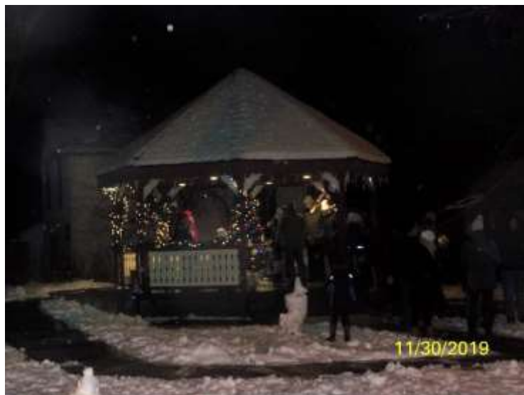
2019 Christmas Tree Lighting – Gazebo Park -