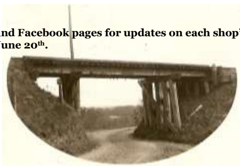
“Old County Road # 40 Underpass”