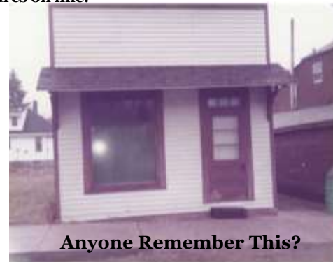
Anyone Remember This?