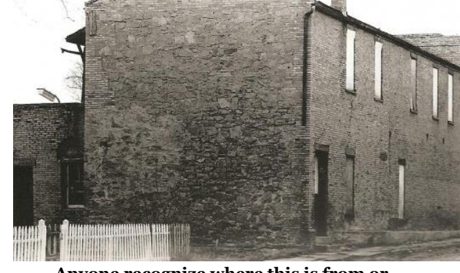
Anyone recognize where this is from or what it was? Hint: 4th St East & Broadway